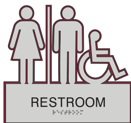
Shown in: Pearl Grey and Bordeaux