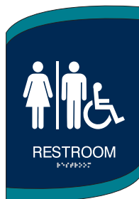
Shown in: Marine Blue and Bahama Blue