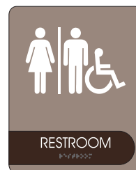
Shown in: Dark Brown and Taupe