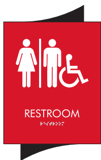
Shown in: Red and Black