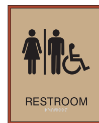
Shown in: Dark Brown and Taupe